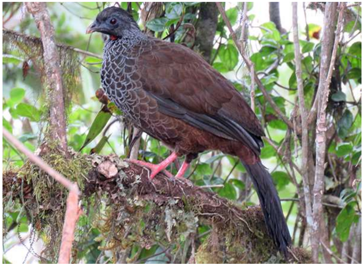
Andean Guan

August 20, Day 3: Morning at El Cajas's Llaviucu Lagoon Area; Afternoon Drive South and Then Eastward to the Andean Foothills at Zamora. After a hearty breakfast, we will pack up and first head a bit downslope to the Llaviucu sector of El Cajas National Park. Depending on how Day 2 went, we may still want to try for Violet-throated Metaltail along with some other species en route . Llaviucu is a lovely area that holds many exciting treasures and, of course, we will be hummer-hunting as one of our main goals, with the chance of finding species like Purple-throated Sunangel, Rainbow Starfrontlet, Sapphire-vented Puffleg, White-bellied Woodstar, Collared Inca, Shining Sunbeam and with some luck, the stunning Purple-backed Thornbill (the shortest-billed hummingbird of all!). Among possible high-Andean tanagers, we'll look for the beautiful Grass-green. Please be warned that several other species may turn up as we walk through shrubby areas, woodland, lake-side marshland and the lake itself: Andean Guan, Masked Trogon, Gray-breasted Mountain-Toucan and a whole selection of smaller highland species are plentiful here, not to mention some high-elevation water fowl.