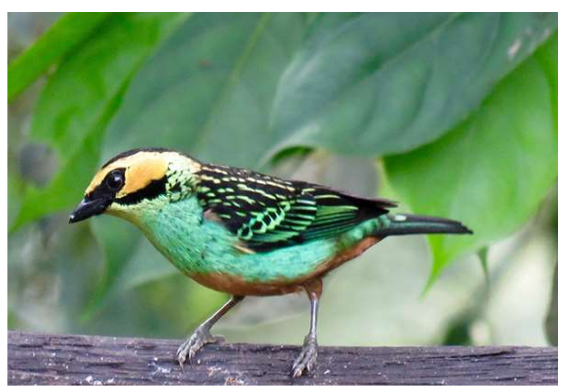
Golden-eared Tanager

August 23, Day 6: Morning at Copalinga; Then Drive Back to the Andean Highlands and South to Tapichalaca Reserve. After some morning hummingbirds, tanagers and whatever else shows up, we will pack up and head off to retrace our steps back upslope to the highland city of Loja and then due south (yes, farther south!) to the Jocotoco Foundation's Tapichalaca Reserve, with a few stops en route to take in the ever-changing scenery, allow us to stretch our legs, and maybe spot more hummers and tanagers. We will be looking out for Andean Emerald, Glowing & Greenish pufflegs, Purple-collared Woodstar, Viridian & Tyrian metaltails, perhaps Neblina Metaltail, Rainbow-bearded Thornbill, and Long-tailed Sylph as we pass through a variety of distinctive habitats. We'll also keep our "eyes peeled," as we advance along this ever changing transect, for mixed foraging