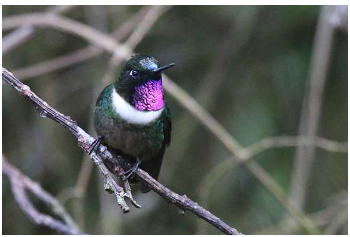
Amethyst-throated Sunangel

Ecuador has long been regarded as the planet's hummingbird and tanager epicenter, and on this exciting sequel to our Northern Ecuador Extravaganza, we'll experience many of southern Ecuador's prime habitats and ecosystems while in pursuit of these spectacular living gems that exemplify the glory of the Neotropics. This trip has been designed specifically for birding enthusiasts and photographers, along with anyone sporting a whim for the joys of Neotropical birding and a special focus on color and glitter! Of the nearly 200 species of hummingbirds and tanagers (including their allies) found in this region, we hope to enjoy well over half of them, including many of the same actors present on our "Northern" tour, along with a whole new cast of superstars!