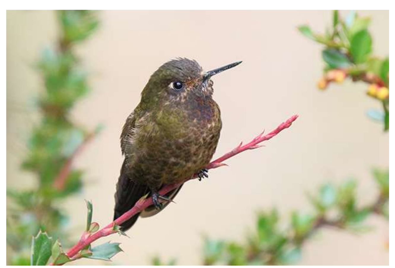
Violet-throated Metaltail at El Cajas National Park

one of South America's most range-restricted hummers. Tanagers could include Hooded and Scarlet-bellied mountain-tanagers, Grass-green and Blue-and-black tanagers, Tit-like Dacnis, and Giant Conebill. A number of other specialties might show up as well, among them, Bearded Guan, Andean Condor, Gray-breasted Mountain-Toucan, and Giant Conebill to name just a few.