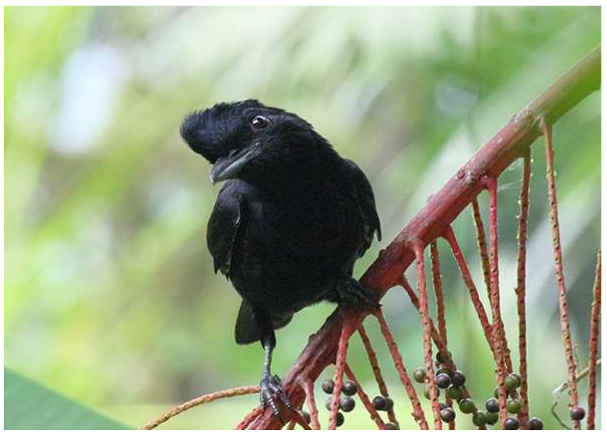
Female Long-wattled Umbrellabird

August 28, Day 11: Morning at Buenaventura Lodge; Drive to Guayaquil. We will have a final morning to enjoy the hummingbirds, tanagers and other forest denizens in this wonderful reserve. After lunch we will pack up and drive back to Guayaquil—backtracking part of the way we traveled on Day 2—arriving in the afternoon at our hotel in time for some R&R, before our final checklist session and farewell dinner. Some participants may choose to depart late tonight.