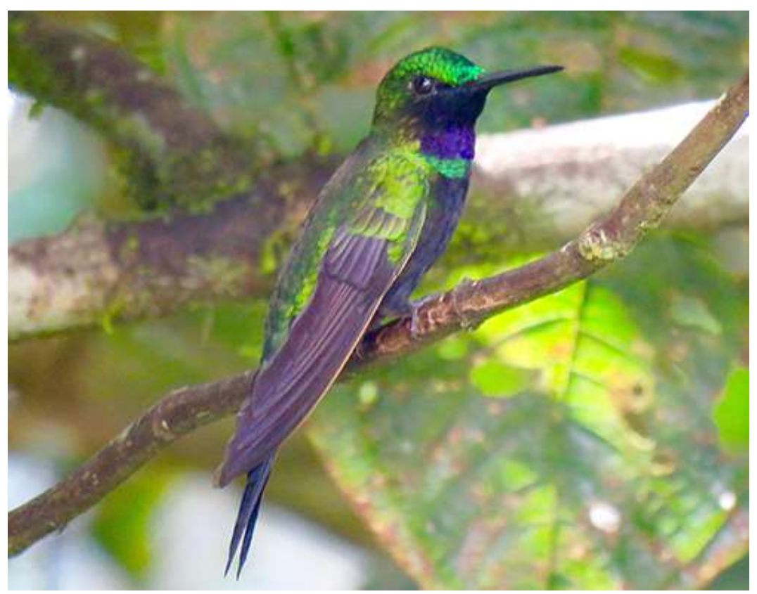
NIGHT: Casa Simpson, Tapichalaca Reserve

flocks and their attendant tanagers. We will reach our lodge, Casa Simpson, in the afternoon, in time to enjoy some hummingbird feeder action.