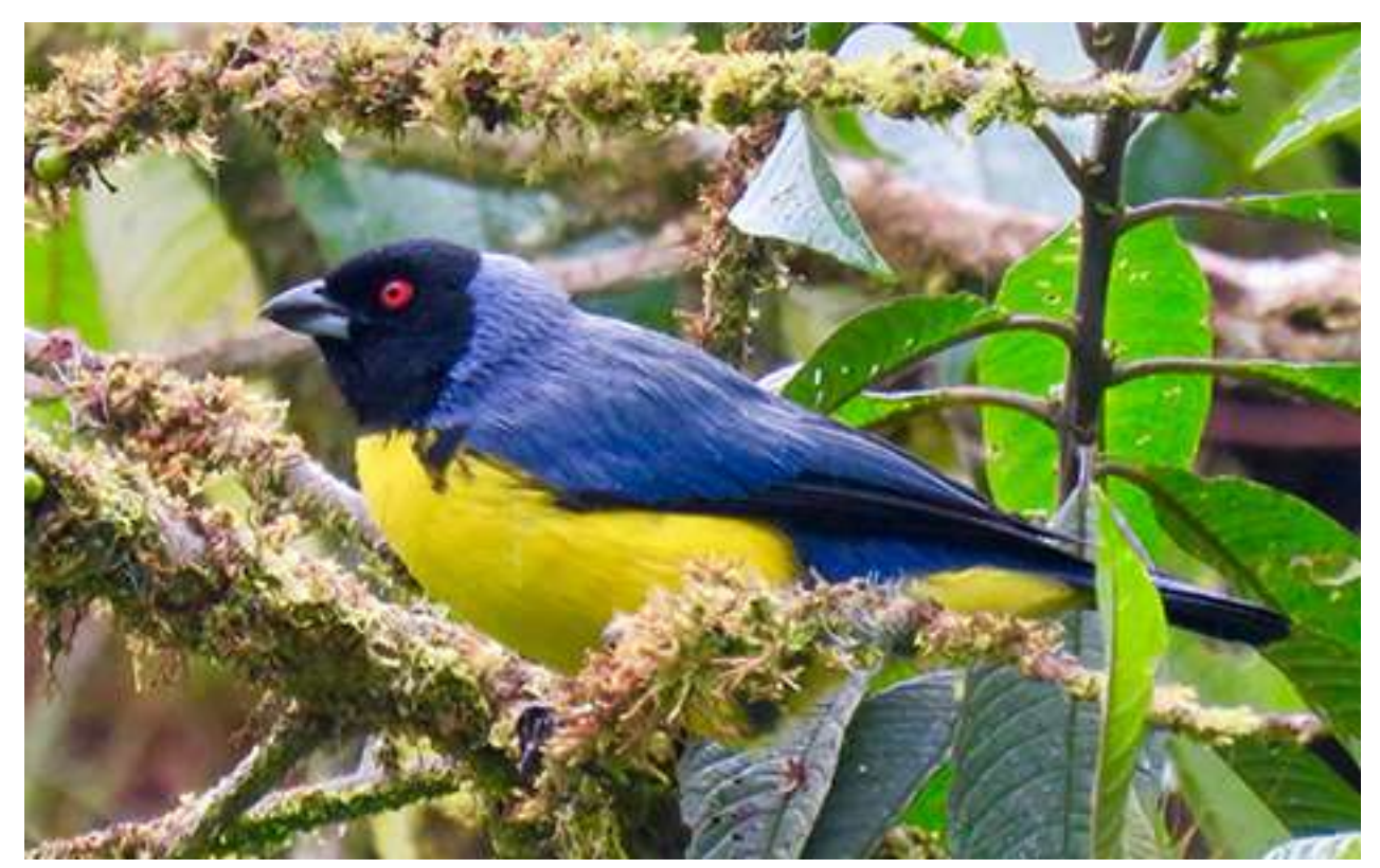
Hooded Mountain-Tanager © Paul J. Greenfield

August 19, Day 2: Morning Departure from Guayaquil; Drive Towards the Andean City of Cuenca; Remainder of the Day Birding at El Cajas National Park. Today, after an early breakfast, we initiate our journey with a drive towards the charming Andean city and Ecuador's cultural capital, Cuenca; its colonial center was declared a UNESCO World Heritage Site in 1999. We will first head south through coastal wetlands and semi-humid and humid zones before heading east as we climb the southwestern slope of the Andes to our first day's destination. We reach upper temperate and páramo zone habitats in the highlands as we approach El Cajas National Park, where we will stop to work shrubby second growth, scrub and humid temperate woodland and forest edge from just about timberline to Polylepis woodland and páramo shrub and grassland in search of our first Andean hummingbird/tanager species. There are no nectar or fruit feeding stations in this area—but fear-not, we will be duly spoiled by them a bit later on—and we will check out flowering shrubs and trees here in hopes of spotting several specialties. Surprisingly, or not so, there are quite a few pretty fantastic species to be found here, and we will work at finding several of them: Sparkling Violetear; Mountain Velvetbreast; Black-tailed & Greentailed trainbearers; Tyrian Metaltail; the range-restricted and endemic Violet-throated Metaltail; Collared Inca;