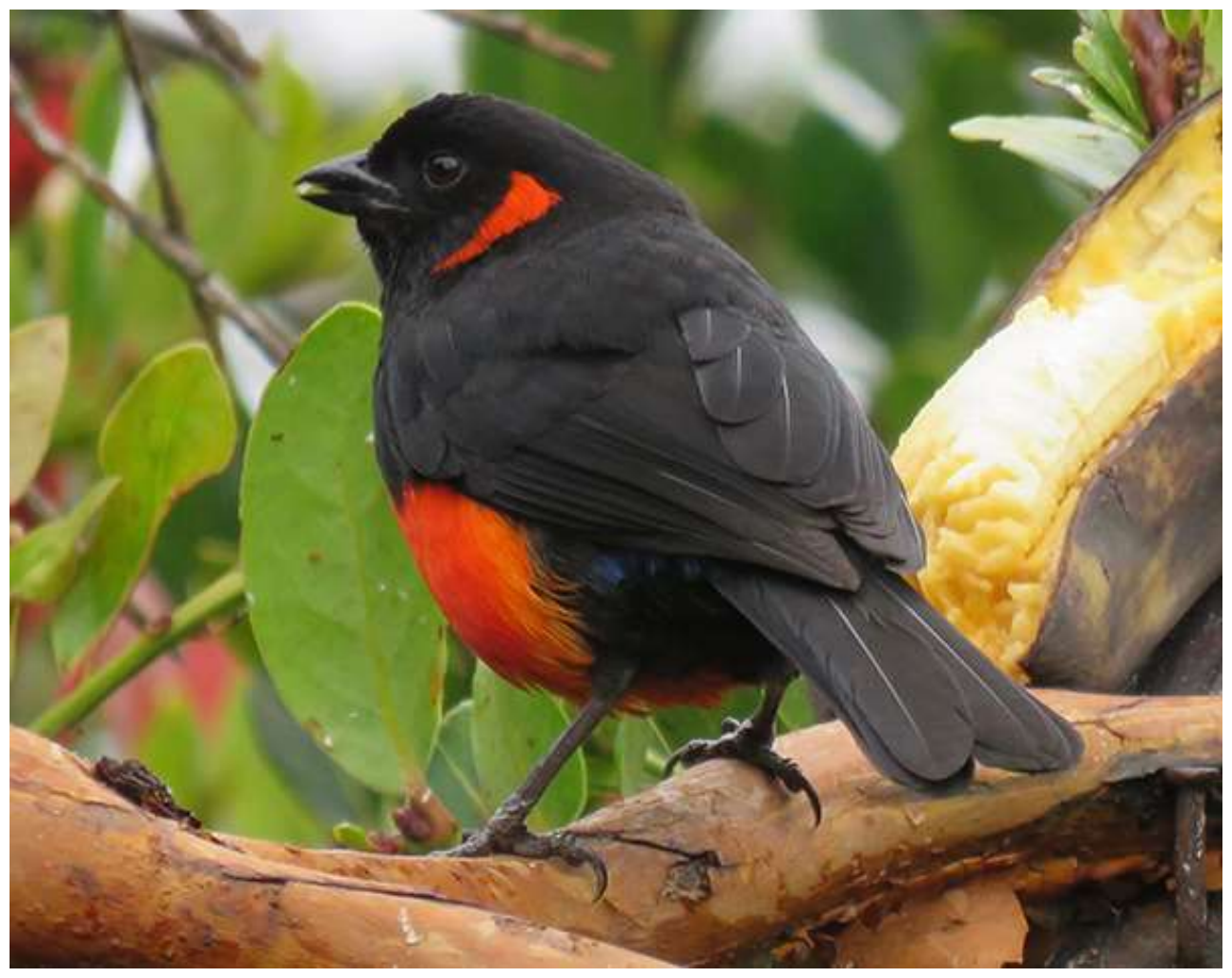
Scarlet-bellied Mountain-Tanager

August 25, Day 8: Drive Northward to Buenaventura Lodge. This morning we will depart from Tapichalaca Reserve after breakfast and drive northwestward to the Buenaventura Reserve, which is set in a remnant stretch of rich humid foothill cloud-forest not far from the quaint town of Piñas in the El Oro Province. This is an area of high endemism with an impressive number of unique species, many tied to the world's richest Chocó endemic bioregion. En route we may make a few roadside stops before reaching the upper section of the reserve, where we will check out some active nectar feeders before working our way to Umbrellabird Lodge in time to do some exciting birding and check out the incredibly active nectar feeders—there is a whole lot to see here!