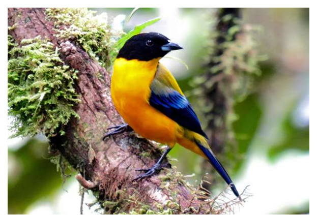
Black-chinned Mountain-Tanager

August 26-27, Days 9-10: Two Days at Buenaventura Lodge. We will enjoy two full days at this incredibly birdy reserve. Among the possible hummingbirds are White-whiskered, Baron's & Stripe-throated hermits; White-tipped Sicklebill; White-necked Jacobin; Brown Violetear; Green Thorntail; Emerald-bellied Woodnymph; Violet-bellied Hummingbird; Rufous-tailed Hummingbird; Amazilia Hummingbird; Andean Emerald; Ecuadorian (White-vented) Plumeleteer; Purple-bibbed Whitetip; Green-crowned Brilliant; Fawn-breasted Brilliant; Brown Inca; Velvet-purple Coronet; Violet-tailed Sylph; Wedge-billed Hummingbird; Purple-crowned Fairy; and Long-billed Starthroat. Tanagers can also be numerous here and we will watch for Blue & Yellow-tufted dacnises; Fawn-breasted, Guira, Rufous-throated, Golden, Silver-throated, Flame-faced, Golden-naped, Beryl-spangled, Blue-necked, Speckled, Bay-headed, & Swallow tanagers; Black-chinned Mountain-Tanager; and so on! We will also offer optional walks in hopes of locating an impressive number of specialties including Gray-backed Hawk, Rufous-headed Chachalaca, the endemic El Oro Parakeet, Bronze-winged Parrot, Redmasked & Gray-cheeked parakeets, Chocó & Chestnut-mandibled toucans, Long-wattled Umbrellabird, Clubwinged Manakin and a plethora of flycatchers, antbirds and furnariids.